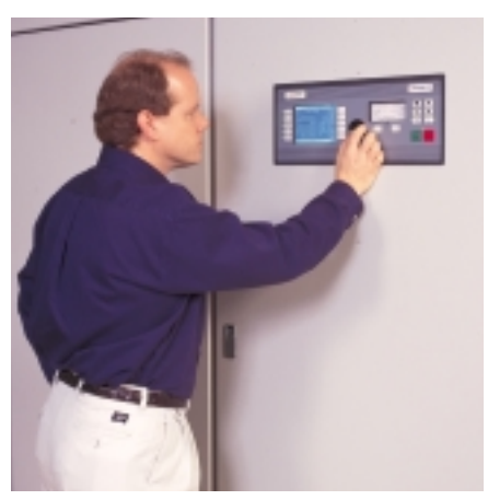
The 3DX-50 is easy to operate.

The DX Destiny is designed for easy use through the IntelliStat™, the ultimate in control and diagnostic user interfaces. This combination of large, internationally-identified control buttons, a status panel with selectable metering, and 1/4 VGA display provides all important control and status parameters needed to know exactly how the transmitter is performing.