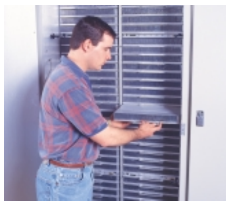
RF modules may be removed while on the air.