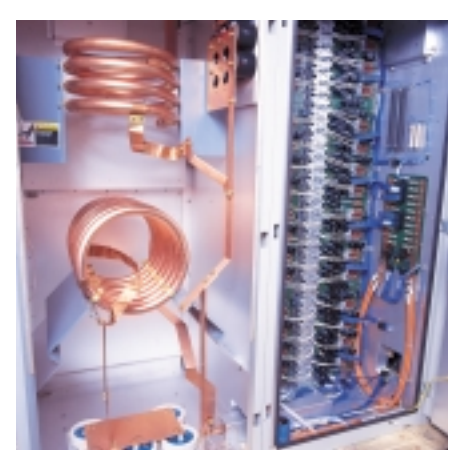
Output Network (left), RF Combiner (right)

Output from RF power amplifiers is summed in a simple, field-proven combiner. The combiner assembly is readily accessible from the rear of the transmitter and redesigned for easier servicing. This allows individual RF motherboards to be easily removed.