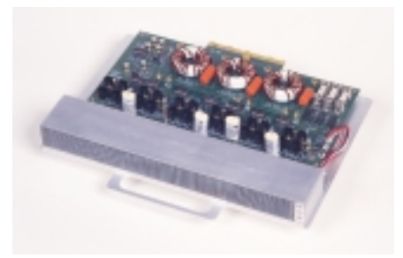
Binary RF Amplifier

The 50 kW DX Destiny uses 62 main and six binary solid-state RF power amplifiers. These modules protect themselves from over-temperature, loss of RF drive, loss of power and shorted RF output conditions, and are hot-pluggable for on-air servicing. These modules are of simple construction with easy access to the individual MOSFET transistors.