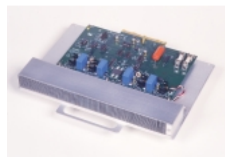
RF Power Amplifier

The 50 kW DX Destiny uses four plug-in serial modulation encoders. Each encoder provides the direct drive to 16 RF power amplifier modules, which are turned ON or OFF to produce the modulated RF signal. All serial modulation encoders are the exact same module and, with the auto-servicing feature, the transmitter can still operate with less than four active encoders.