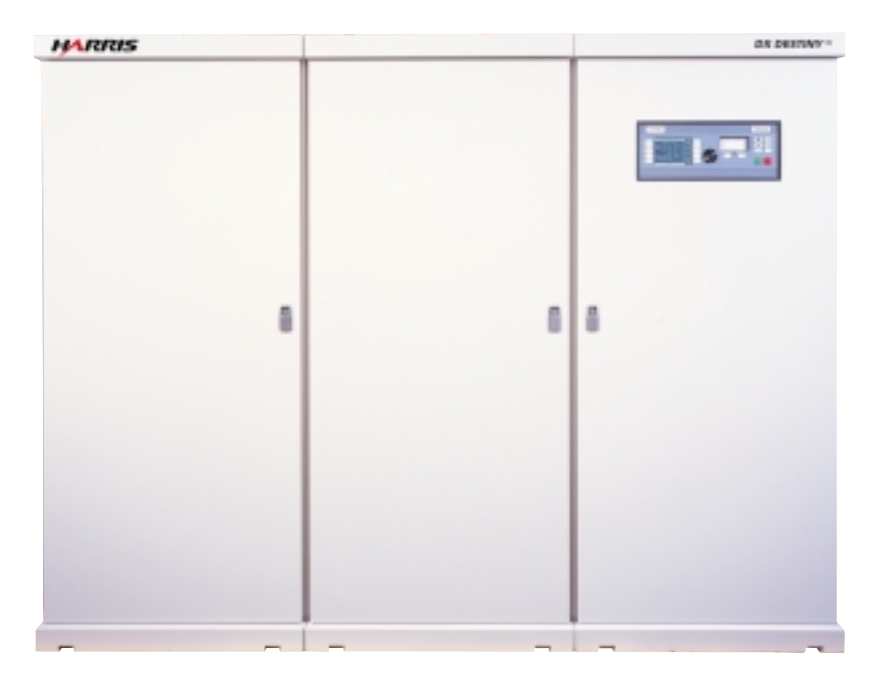
Power Supply Cabinet